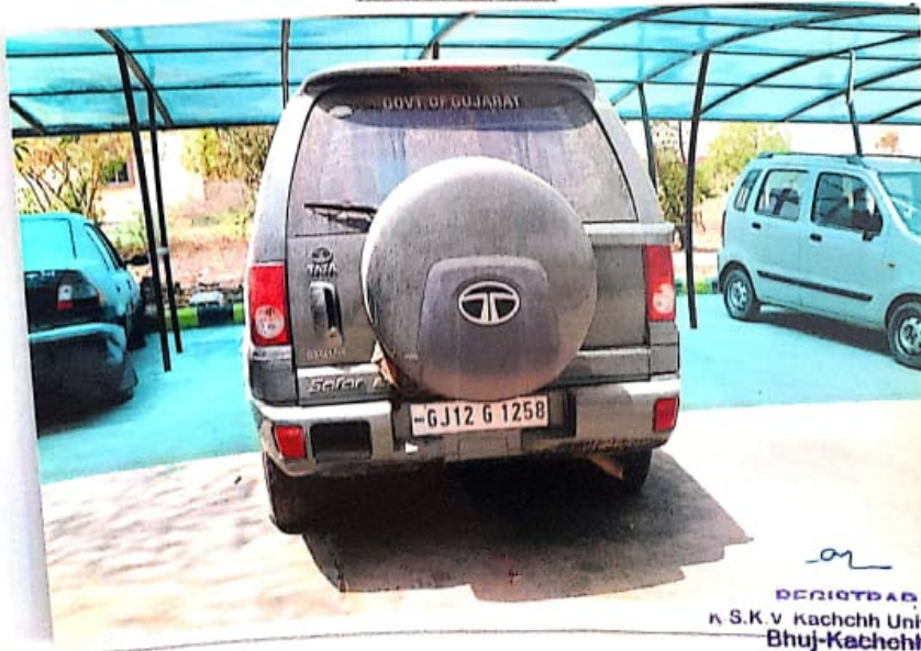
પાછળ ની બાજુનો કલર ફોટો નંબર પ્લેટ સાથે. (back colour photo)

an REGISTRAR K.S.K.V Kachchh University Bhuj-Kachchh