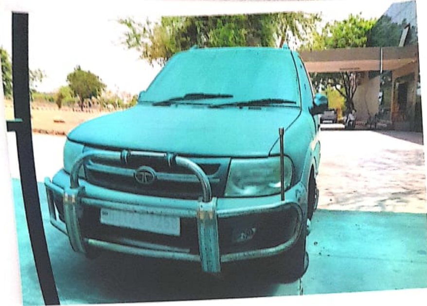
TATA SAFARI (GJ 12 G 1258) આગળ ની બાજુનો કલર ફોટો નંબર પ્લેટ સાથે. (front colour photo)

an REGISTRAR K.S.K.V Kachchh University Bhuj-Kachchh