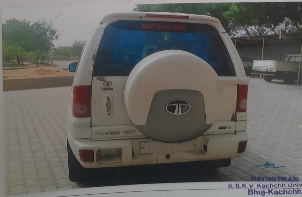
પાછળ ની બાજુનો કલર ફોટો નંબર પ્લેટ સાથે. (back colour photo)

REGISTRAR K.S.K.V Kachchh University Bhuj-Kachchh